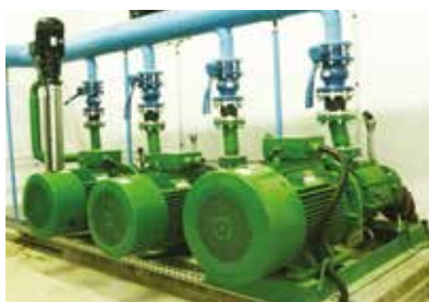
MULTISTAGE ELECTRIC PUMPS - MEK SERIES