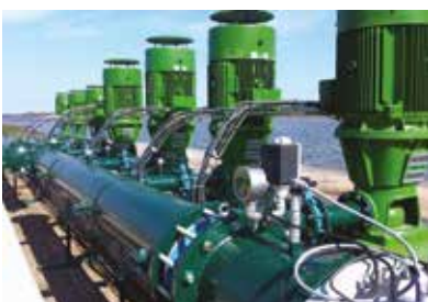
VERTICAL LINESHAFT PUMPS - V SERIES