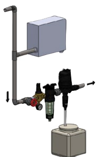
tank feed installation