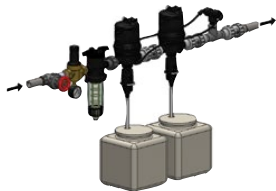
dual remote injection installation